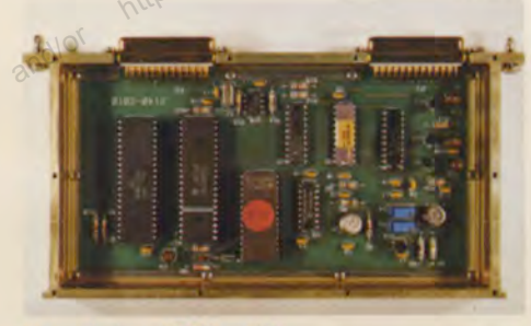
Internal view of CPU module.

AGC is RF derived with average detection in AM mode and peak detection in all other modes. The design features fast attack, selectable hold and fast release.