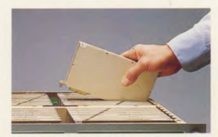
The R-3030 is quicker and easier to maintain than any receiver in its class.

While the overall mean time to repair for R-3000 series receivers is less than 30 minutes, most faults can be diagnosed and corrected in less than half that time.