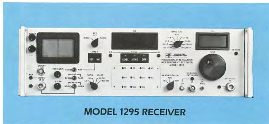
MODEL 1295 RECEIVER

Automatic operation entails the characterization of a device at discrete frequencies over the range of interest. This is accomplished by entering F1 (low frequency limit); F2 (high frequency limit) and step size. Under computer control, the source and receiver are directed to each frequency in turn and a reference measurement is stored in the computer memory. Subsequently, the Device Under Test (DUT) is inserted between source and receiver and the measurement sequence is repeated. The computer then uses the measurements to calculate the attenuation values and present the data to the user in the form of a printout or data plot.